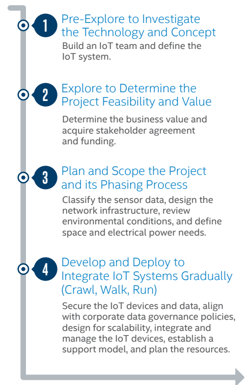
Figure 2. Intel IT uses a roadmap while planning, designing, and integrating IoT systems. This method helps us streamline future implementations of IoT systems and can guide other organizations that plan to do the same.