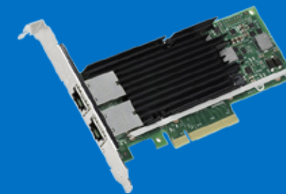
Intel® Ethernet Converged Network Adapter X540: 10GBASE-T simplifies the migration to 10GbE.

Solve the problem of increased network demands and the growing need to support virtualization with 10GbE Intel® Ethernet