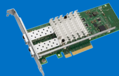
Intel® Ethernet Converged Network Adapter X520: 10GbE SFP+ connectivity provides ultimate flexibility and scalability.